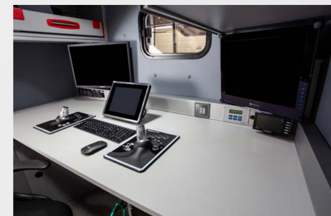
Transverse fit-out with DCX5000