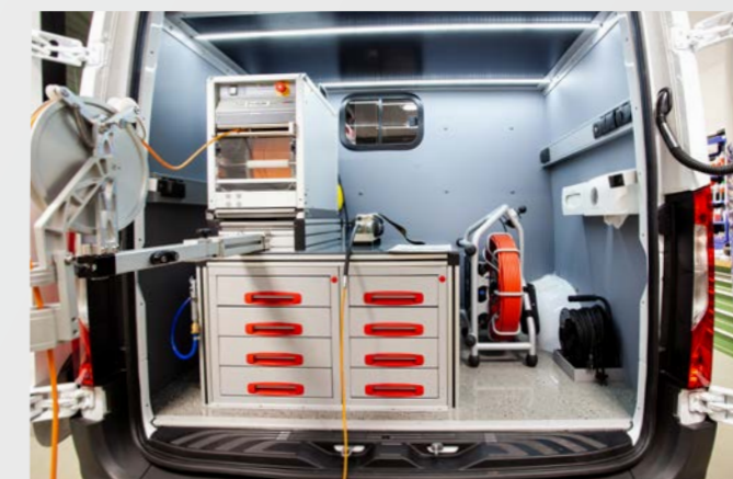
Transverse fit-out with 300m main sewer system and push system