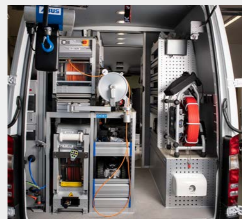
Longitudinal fit-out with 500m main sewer, SAT system and push system