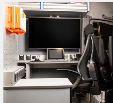
Longitudinal fit-out with DCX5000